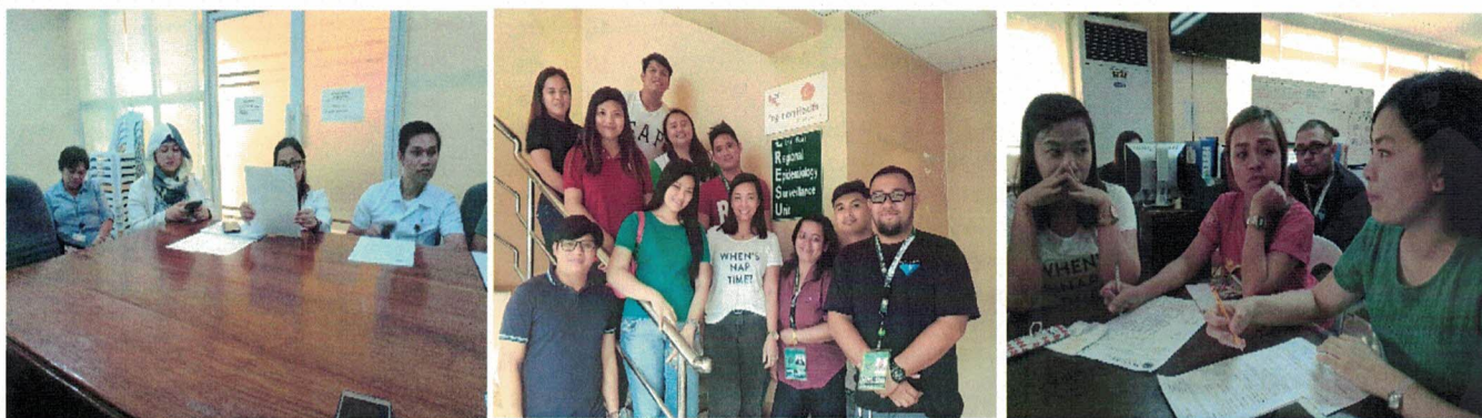
Conduct of Supervisory Visit on the Implementation of Surveillance for Adverse Events among Dengvaxia Vaccinees (AEDV) in RESU Region VII